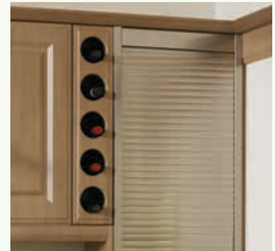
Round Wine Rack (5, 10 & 15 bottle available)