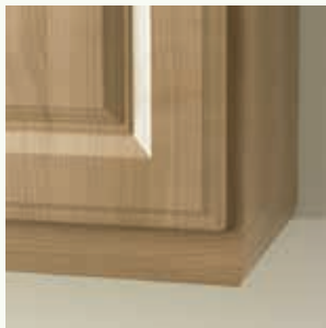
Tangent Light Pelmet**