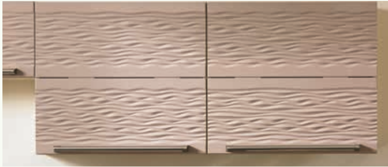
Sahara Carved Doors (shown in horizontal style)