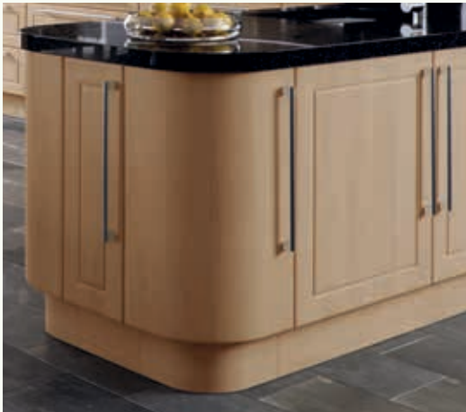
Plain Curved Doors

Curved doors have a silver back and are supplied with a plain design on all door styles except shaker which is matching.