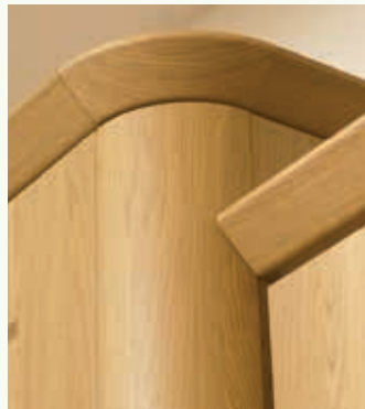
Curved Corner Feature & Tangent Cornice**