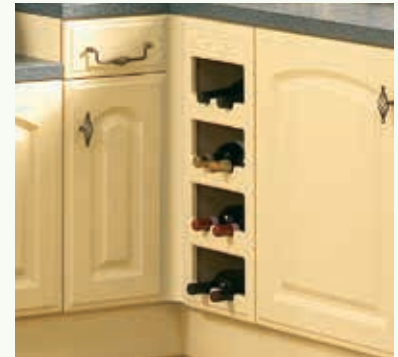
Frieze Pattern Wine Rack* (4, 8 & 16 bottle available)