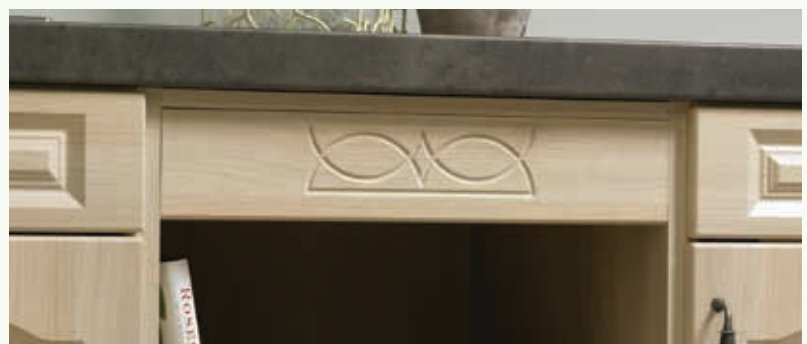
Frieze Pattern Pelmet*

Can be used in a cabinet or as a window pelmet (available in any length)