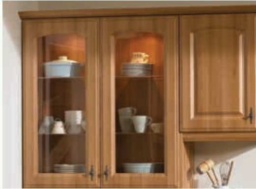
Glazed Doors. Available in all styles (shown in verona style)