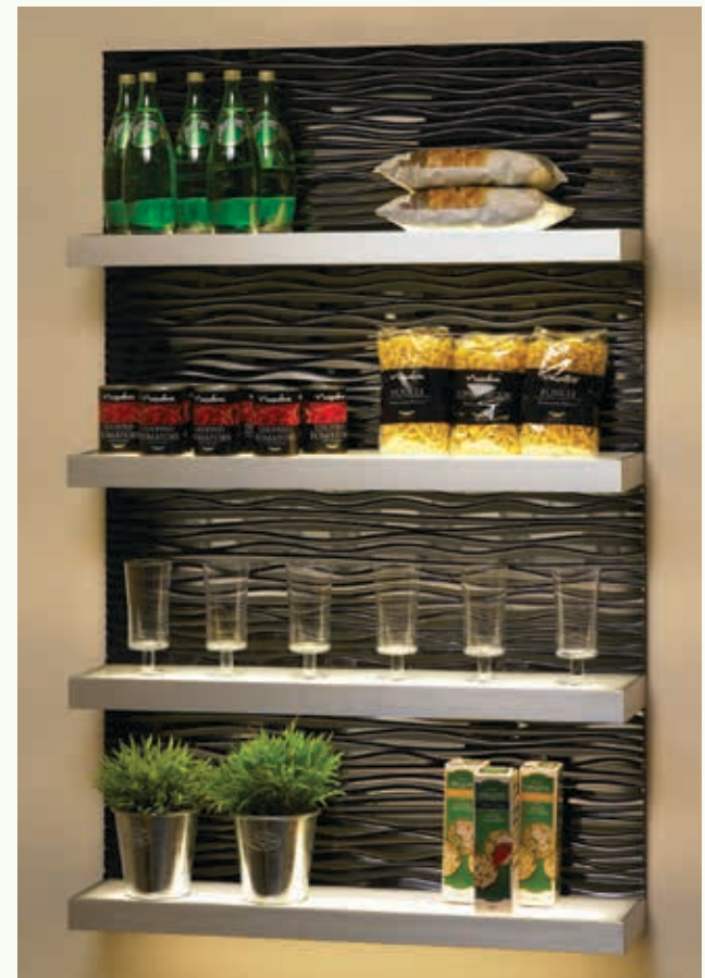
Sahara Carved Panels (used to create shelving feature)