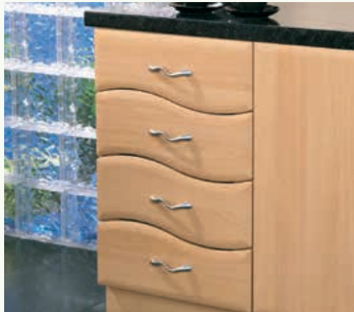
Wave Design 4 Drawer Unit