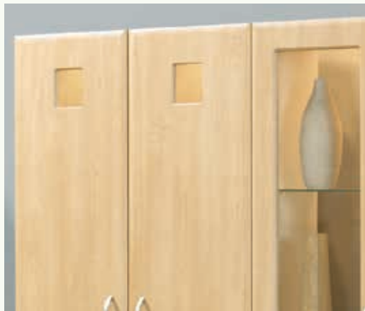
Glazed Square Hole Doors