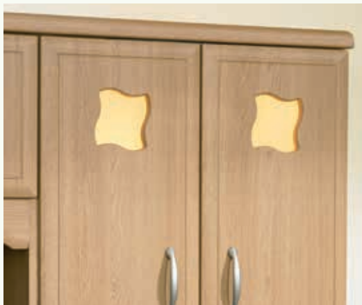
Glazed Wave Hole Doors