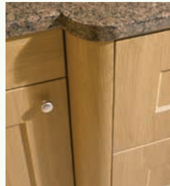
Stepped Curved Feature**