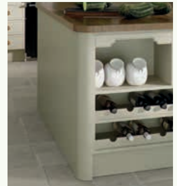
Curved Feature End Panel**