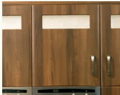
Glazed Letterbox Doors