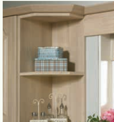
Wall End Shelf Unit