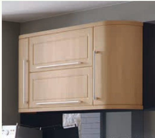
Plain Curved Doors (shown on wall cabinet)