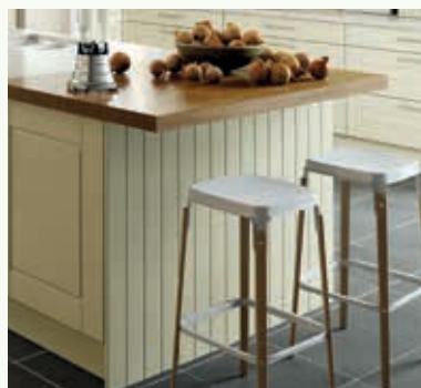
T&G End Panel*