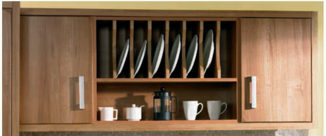
Chunky Surround Feature