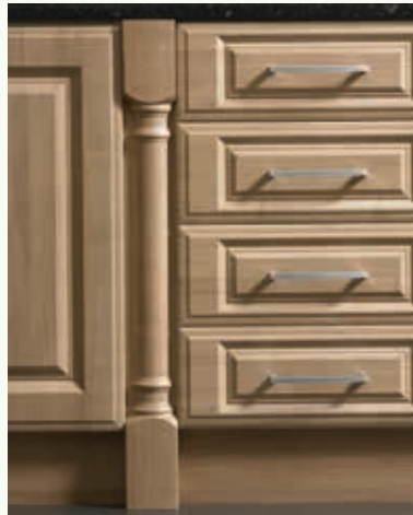
Gun Barrel Pilaster*