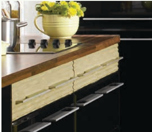
Sahara Carved Drawers