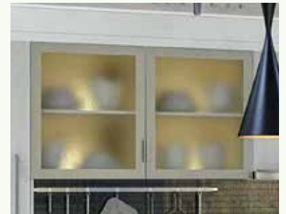
Aluminium Frame Glazed Doors with Obscure Glass