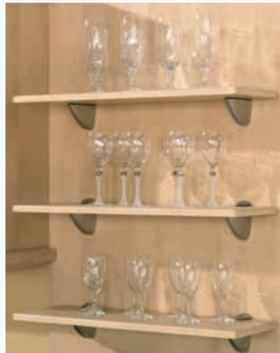
Matching Shelves with Brushed Steel Brackets (available in any size to suit)