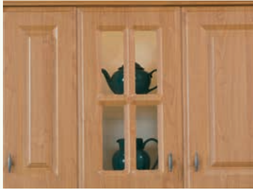
Georgian Glazed Doors* Available in all styles (shown in palermo style)