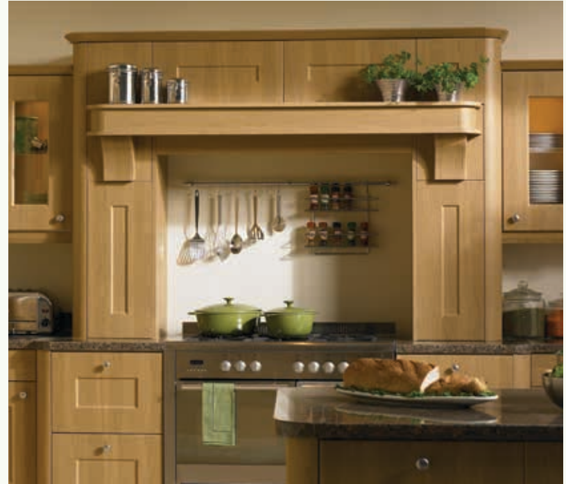
Mantle shown with broad shelf option** (available in any width to suit your cooker)