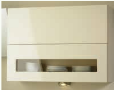
Glazed Letterbox Doors