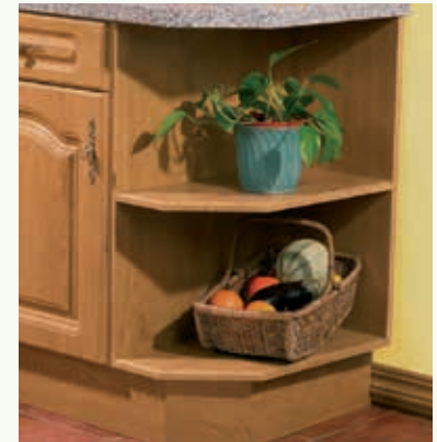
Base End Shelf Unit