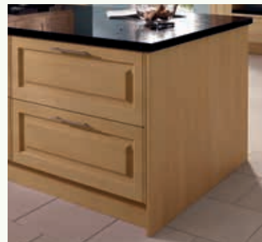
Plain End Panel