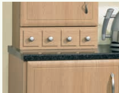
Mock Spice Drawer