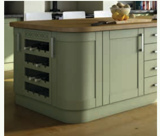
Shaker Design Curved Doors*