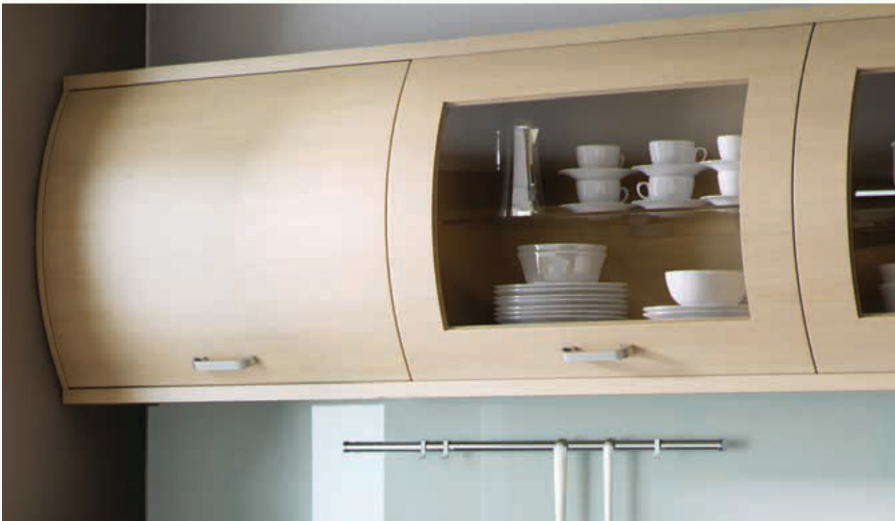
Horizontal Curved Door and Horizontal Glazed Curved Door