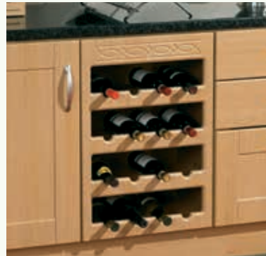
Frieze Pattern Wine Rack* (4, 8 & 16 bottle available)