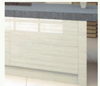
Pillar End Panel