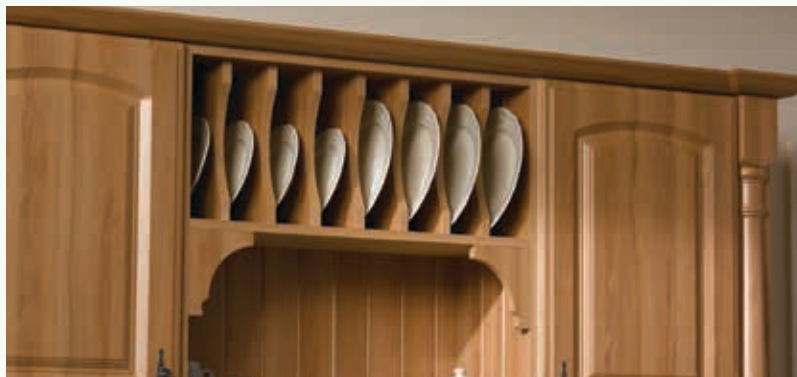
Plate Rack Unit with T&G Panels* & Corner Brackets*