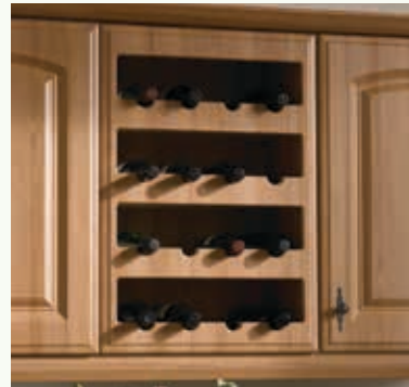
Plain Wine Rack* (4, 8 & 16 bottle available)