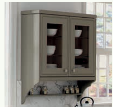
Scroll End Panels with Shelf (Available plain or T&G*)