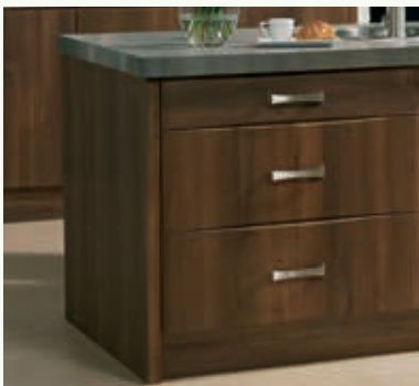
Chunky End Panel