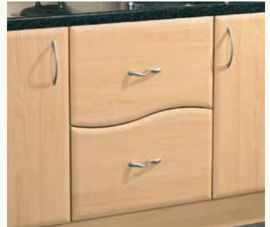
Wave Design 2 Drawer Unit