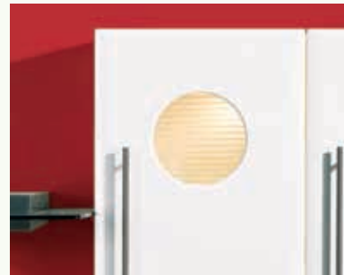
Glazed Porthole Doors