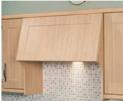
Modern Canopy (front panel supplied to suit door style)