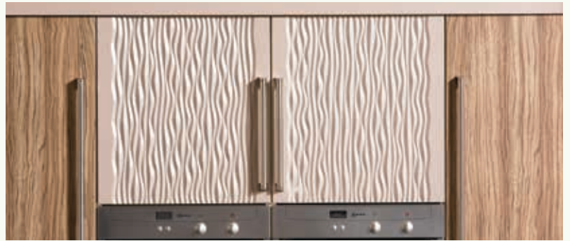
Sahara Carved Doors (shown in vertical style)