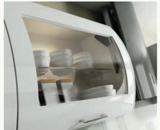
Horizontal Glazed Curved Doors

Glazing Options: Standard glazing options include clear, frosted or stippled acrylic safety glass. If you have any alternative requests please speak to your dealer. Note: Aluminium glazed doors are supplied with frosted glass.