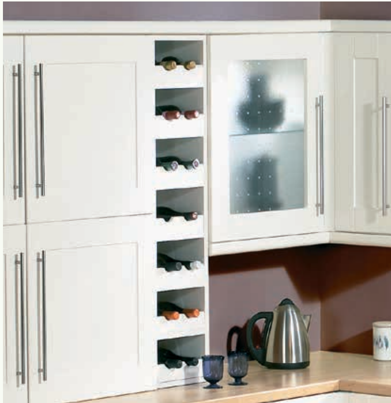
Unit with Wine Rack Shelves