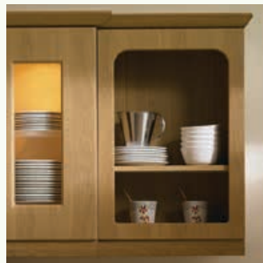
Display Cabinet Surround