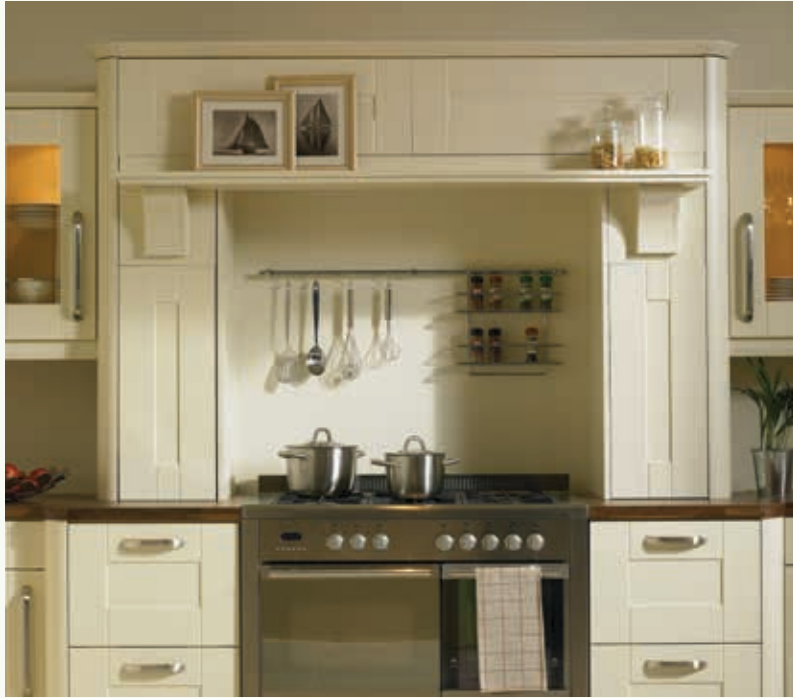
Mantle shown with narrow shelf option** (available in any width to suit your cooker)